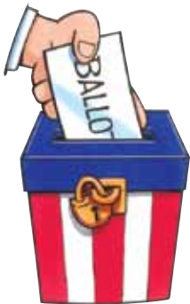
Voter Service Report Page 3