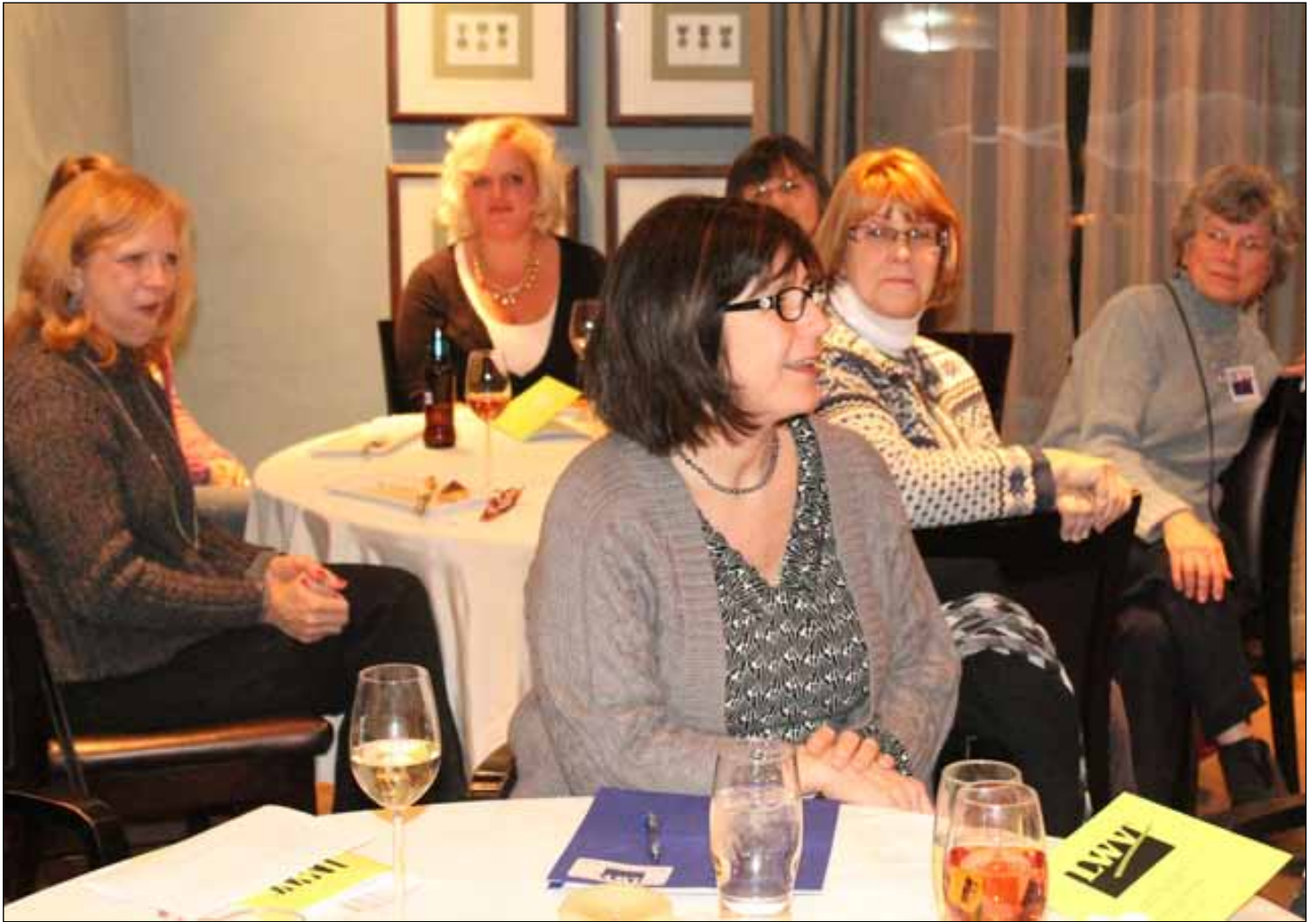
Tell us about yourself! Introductions all around at the start of the evening.